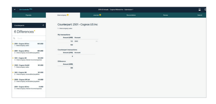
Figure 2: Cognos Controller provides an intuitive web application for intercompany reconciliations.